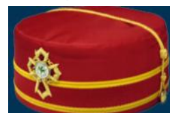
“Red Cap” of a 32nd degree Knight Commander of the Court of Honor of the Ancient and Accepted Scottish Rite of Freemasonry.