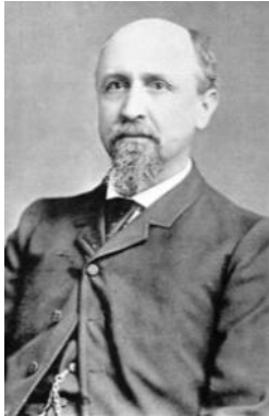
Lawrence Sullivan Ross—1838-1898 Soldier, Statesman, Knightly Gentleman, Brig. General C.S.A., Governor of Texas, President of AMC

“The three steps delineated upon the Master’s carpet are emblematical of the three principal stages of human life, youth, manhood and old age.”