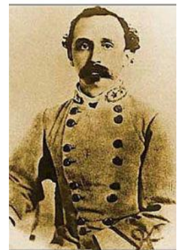
Lawrence Sullivan Ross—1838-1898 Sol- dier, Statesman, Knightly Gentleman, Brig. General C.S.A., Governor of Texas, President of AMC

The Annual Sweetheart Dinner will be held February 13th at 5:30 p.m.