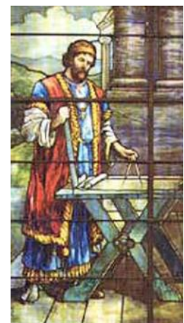
Stained glass depiction of our Ancient Grand Master drawing his designs upon the trestle.

“... be true and faithful, and imitate the example of that celebrated artist whom you have this evening represented.”