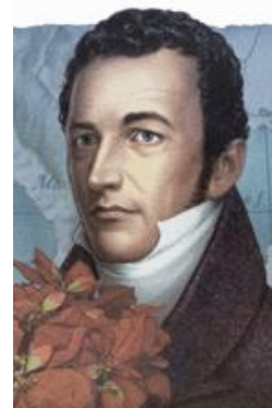
Bro. Joel R. Poinsett (3/2/1779—12/12/1851) served as Master of Recovery #31 & Solomons #1 in Greenville and Charleston, SC respectively.

Brother Poinsett served as Deputy Grand Master of SC, but never served as Grand Master having been appointed as Secretary of War under President Van Buren.