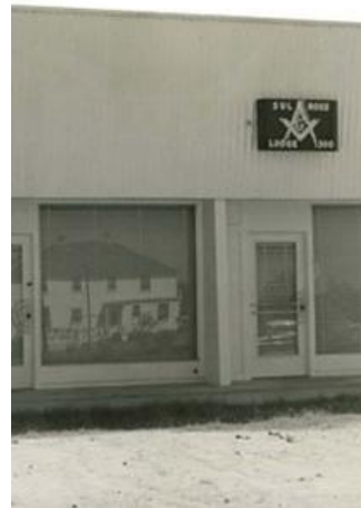
The Dan Russell Building at 312 Jersey Street on Southgate, home of Sul Ross Lodge from 1951-2000.