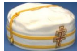
“White Cap” of an Inspector General Honorary of the 33rd and last degree of the Ancient and Accepted Scottish Rite of Freemasonry.

These honors are such that many serve in the quarries for a lifetime having not attained such honors. Congratulations brethren on the honors recently received.