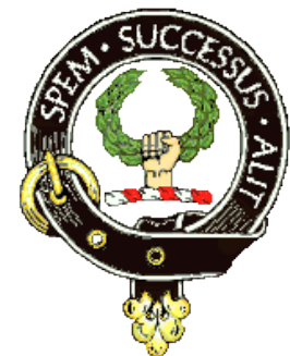
Crest of Clan Ross. Sprig of evergreen held aloft. Motto: Success Nourishes Hope

“... be true and faithful, and imitate the example of that celebrated artist whom you have this evening represented.”